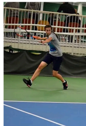
LTA Young Person of the Year (National Runner-Up) 2019/20