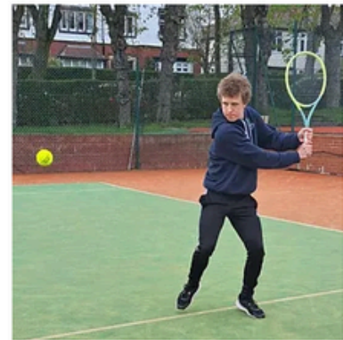
LTA Young Person's Welfare Ambassador