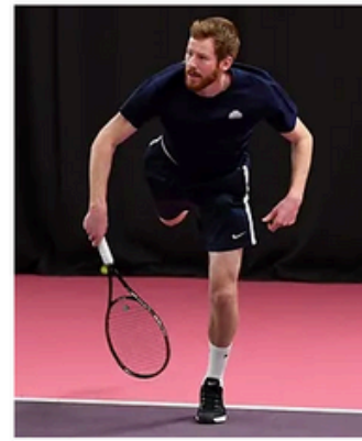
Northern Coach of the Year (Development) 2020/21

He currently competes in LTA British Tour and Grade 3 events and is always working on improving his own game. His current LTA World Tennis Number is 9.0 and has been ranked top 70 in Great Britain. He was a hitting partner at Wimbledon 2018, working with Kyrgios, Monfils, Simon, Diatchenko, and Vekic.